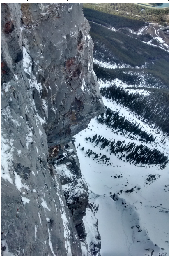
Looking up at pitch 6 and showing pitch 7. Line shows route taken. Possible alternate is out left earlier.

Looking down at pitch 5 and 6 from the belay after the traverse at top of pitch 6